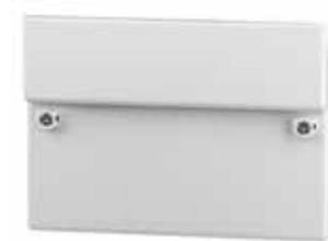
Terminal covers in different versions