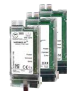
Meter modem VARIOMOD-XC (LTE, Ethernet) and interface module (RS232, RS485)