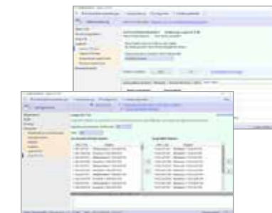
Communication and parametrisation software with user-friendly interface