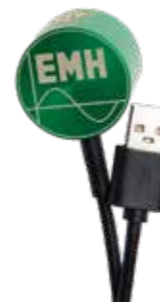
Optical communication unit (OKK USB)

The LZQJ-SGM can be functionally enhanced with the following accessories: