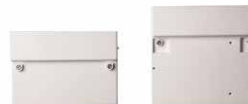
Terminal covers in different lengths Standard version: L = 130.0 mm Long version: L = 167.5 mm