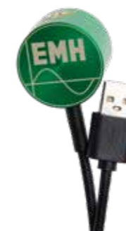
Optical communication unit (OKK USB)