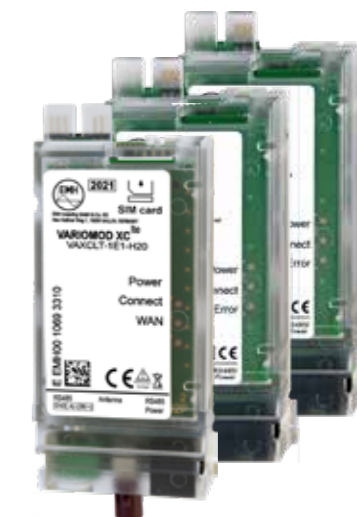
Meter modem VARIOMOD-XC (LTE, GPRS, Ethernet) and interface module (RS232, RS485)